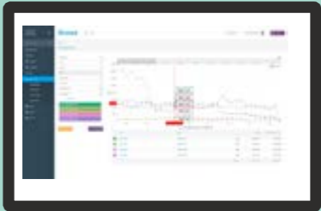
View consumption in kWh for the previous month