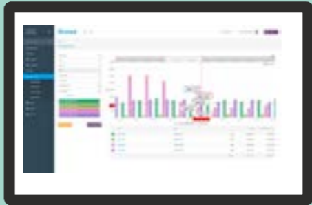
View consumption data at half-hourly, daily, or weekly level

If you don't have an online account yet, please register at orstedportal.co.uk