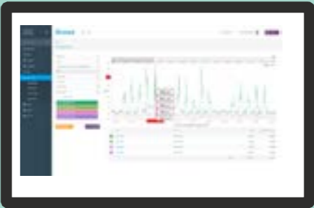
View consumption costs (£) for the previous month