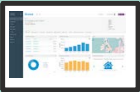
Customisable dashboard gives you the information you need at your fingertips